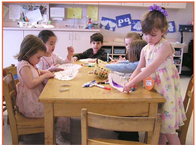
FPC children's Sunday school

A WILL IS THE CORNERSTONE OF A SENSIBLE ESTATE PLAN. ESTATE PLANNING GIVES US THE CHANCE TO MAKE AN ENDURING STATEMENT OF FAITH. WITH OUR FINAL ACT OF STEWARDSHIP WE CAN LEAVE A LASTING MARK ON OUR CHURCH OR ON A PARTICULAR MINISTRY OR MISSION PROGRAM.